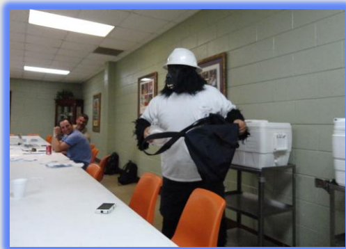
Employee meeting guest speaker

Thanks again to all employees and staff for another successful meeting!