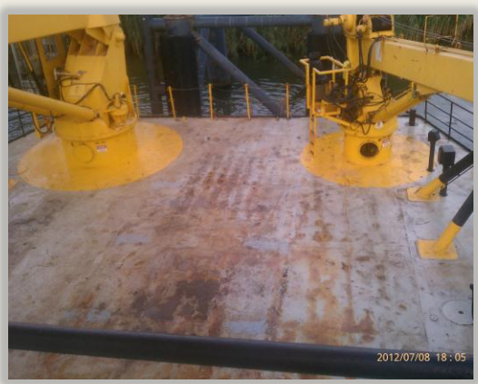
Before and After A-I Deck Great Job!!